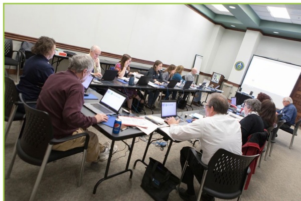
NETL Hosts Area Teachers at Computer Workshop — Recap, April 13, 2018

NETL's Pittsburgh site hosted the U.S. Small Business Administration's (SBA) annual meeting for 8(a) Small Business Development Program participants. The 8(a) program provides valuable assistance to help small, disadvantaged businesses compete in the marketplace. NETL is proud to participate by hosting the annual meeting, co-sponsored by the SBA's Pittsburgh and West Virginia district offices. In addition, NETL supports the many small businesses that contribute to the Lab's work to develop innovative technology solutions for America's energy challenges.