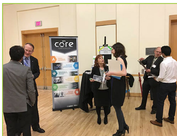
NETL at Carnegie Mellon University Energy Week — Recap, April 6, 2018

One of the ways that NETL amplifies its STEM educational outreach is by leveraging strategic partnerships with various organizations. For example, the Spectroscopy Society of Pittsburgh and the Society for Analytical Chemists of Pittsburgh present the Light, Color, and Spectroscopy for Kids teacher workshop each year at the Pittsburgh site. The 2018 workshop took place on April 6 and featured fun activities such as learning how to project a color spectrum that can be used to teach things like color addition and subtraction.