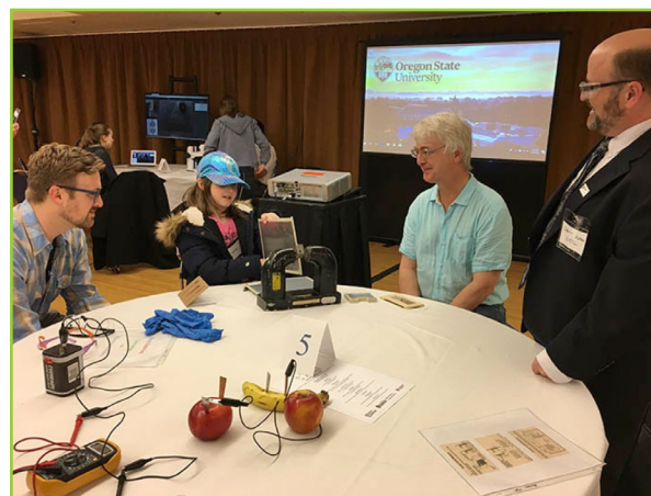
NETL Co-Hosts Student Mentoring Program to Encourage Stem Careers

NETL co-hosted a special event April 18 to help mitigate participation disparities in STEM fields by connecting enthusiastic professionals with interested students and their educators. NETL, the DOE, and Oregon State University (OSU) College of Science hosted the Mid-Willamette STEM Mentoring Café at OSU's Memorial Union in Corvallis, Oregon. Middle and high school students broke into small groups for speed mentoring sessions, during which they had the opportunity to chat with STEM role models, see samples of their work, and ask questions. Educators received take-home materials to continue STEM engagement with their students. Participating professionals were encouraged to offer ongoing mentoring to students and educators in their community.