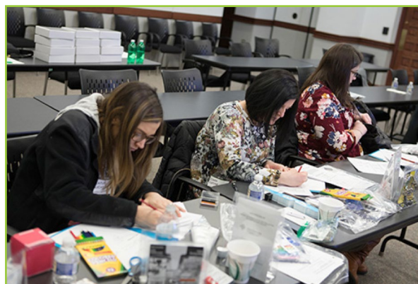
NETL Hosts Area Teachers at Science of Light Workshop — Recap, April 6, 2018

One of the ways that NETL amplifies its STEM educational outreach is by leveraging strategic partnerships with various organizations. For example, the Spectroscopy Society of Pittsburgh and the Society for Analytical Chemists of Pittsburgh present the Light, Color, and Spectroscopy for Kids teacher workshop each year at the Pittsburgh site. The 2018 workshop took place on April 6 and featured fun activities such as learning how to project a color spectrum that can be used to teach things like color addition and subtraction.