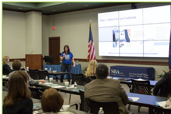
NETL Small Business Meeting — Recap, April 13, 2018

of Science and Technology Strategic Plans and Programs, delivered a keynote address on Thursday afternoon. NETL also exhibited during the career fair, and employees shared the Lab's involvement with the Oak Ridge Institute for Science and Education and Mickey Leland Energy Fellowship programs with interested participants. Other events included an investor forum, Department of Energy-sponsored Allegheny Region Cleantech University Prize Collegiate Competition and lectures on important topics related to NETL's efforts to stimulate a growing economy and improve the health, safety, and security of all Americans.